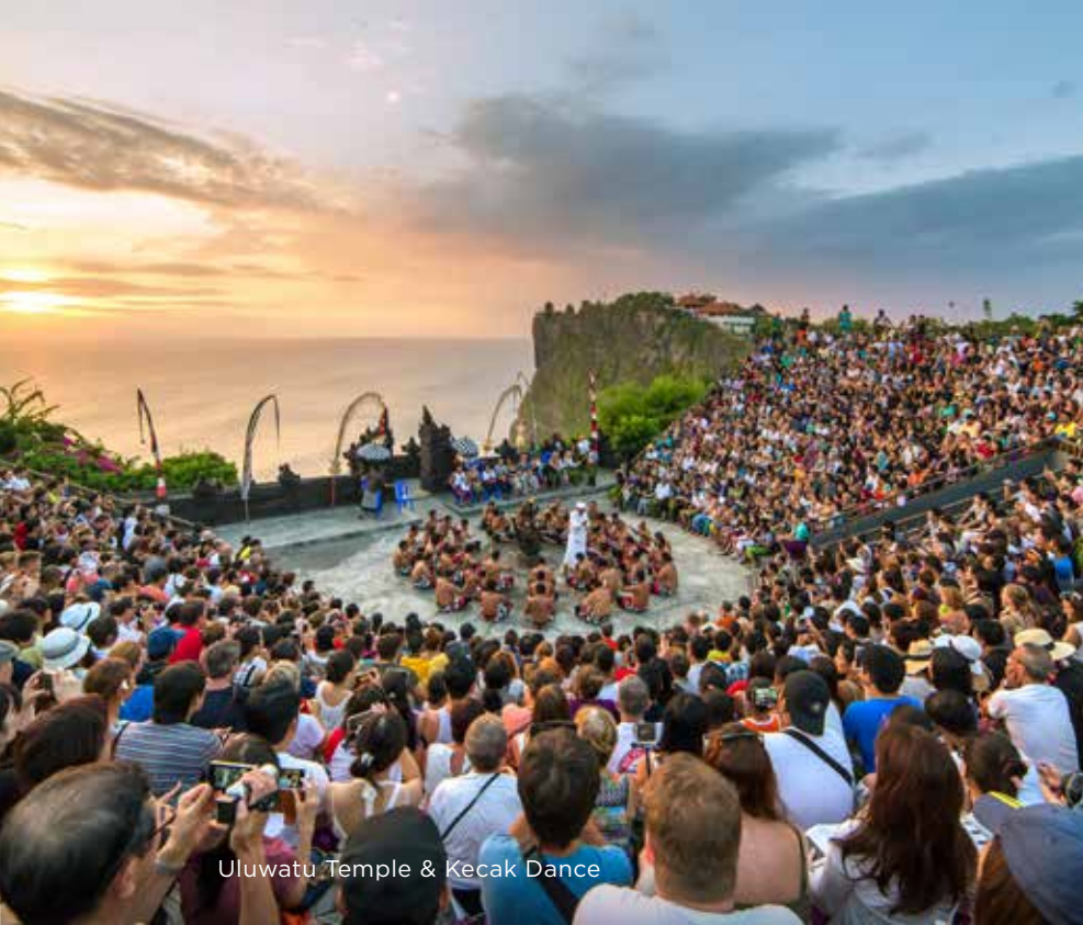
Uluwatu Temple & Kecak Dance