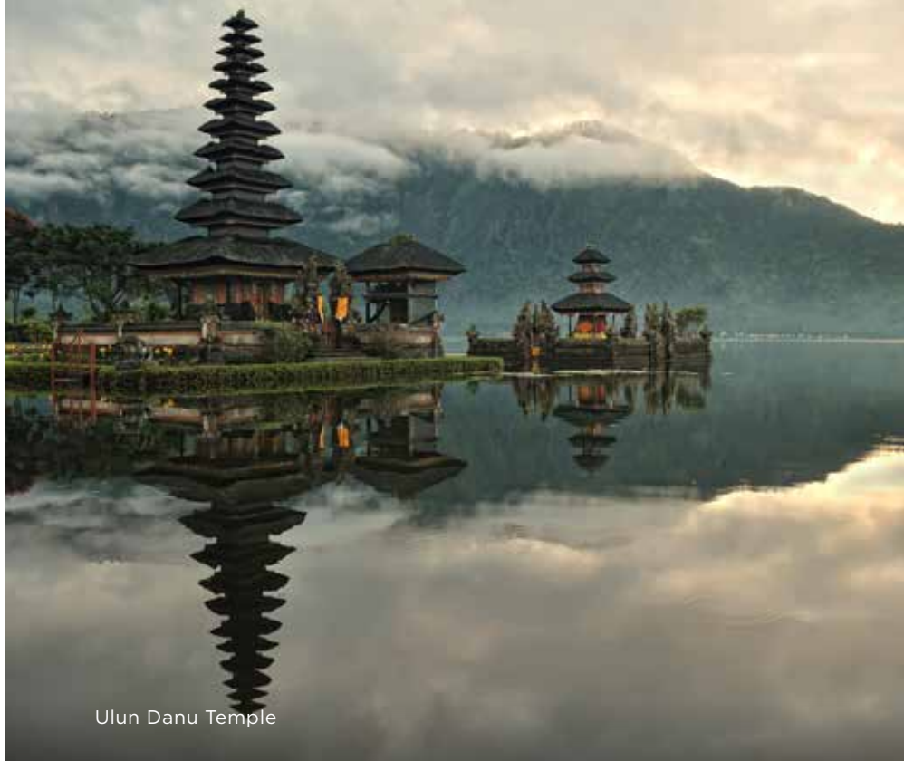
Ulun Danu Temple