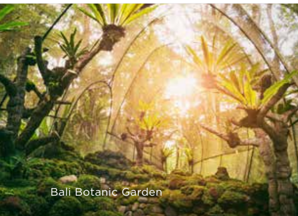
Bali Botanic Garden