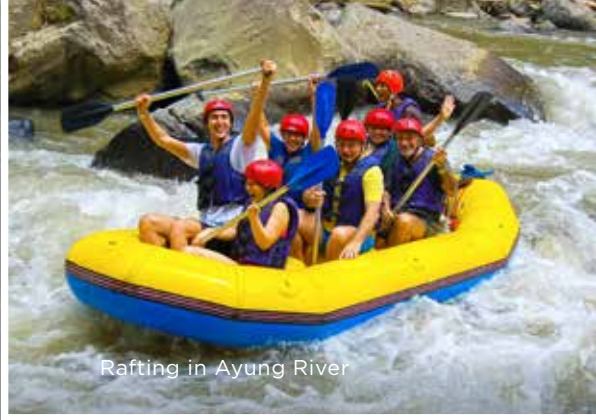
Rafting in Ayung River