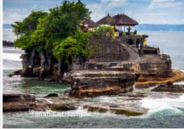
Tanah Lot Temple