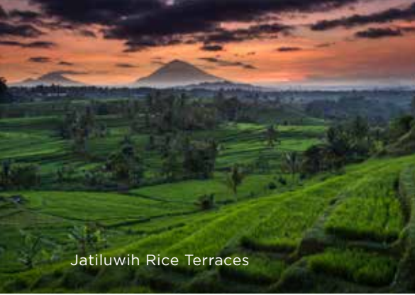
Jatiluwih Rice Terraces