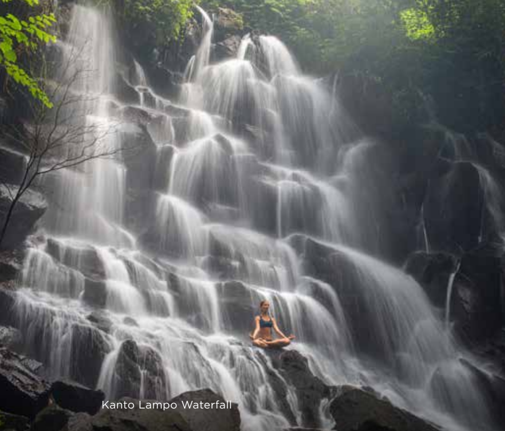
Kanto Lampo Waterfall