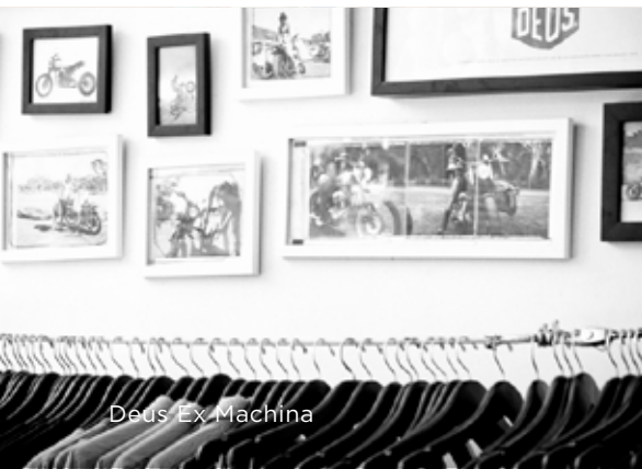
Deus Ex Machina