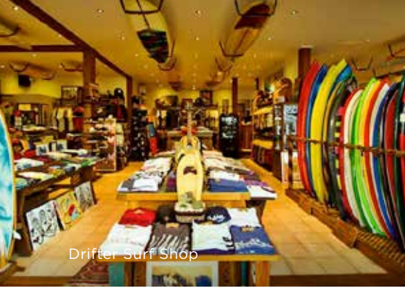
Drifter Surf Shop