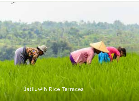
Jatiluwih Rice Terraces