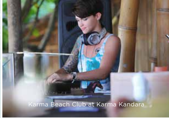
Karma Beach Club at Karma Kandara