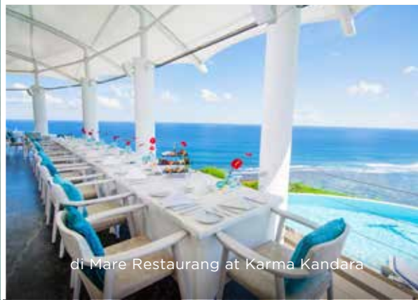
di Mare Resturang at Karma Kandara