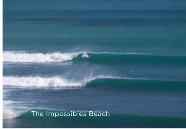
The Impossible Beach