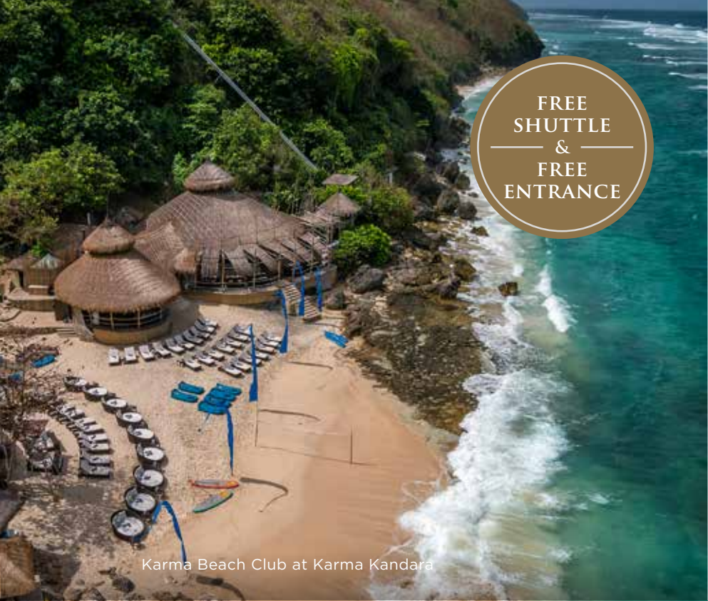
Karma Beach Club at Karma Kandara