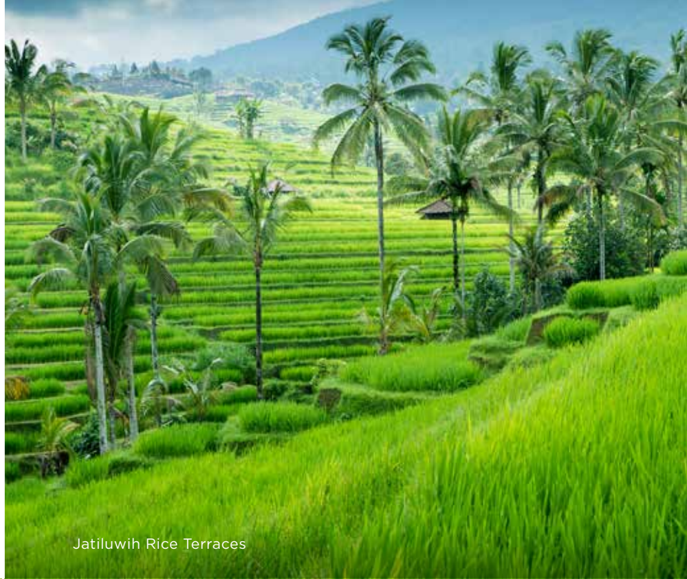
Jatiluwih Rice Terraces