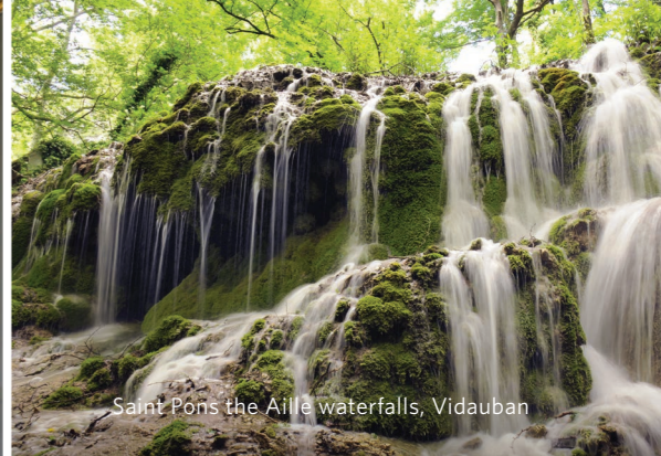
Saint Pons the Aille waterfalls, Vidauban