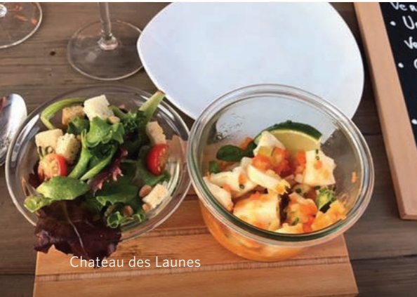
Chateau des Launes