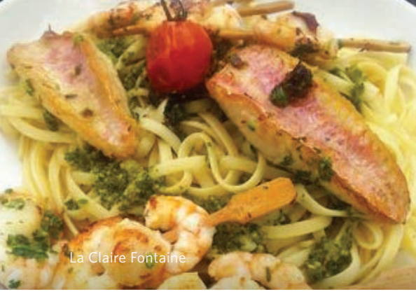
La Claire Fontaine