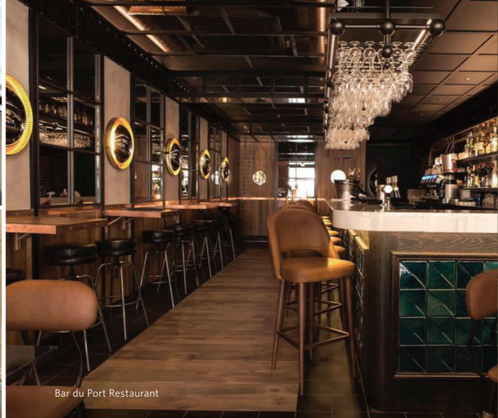
Bar du Port Restaurant