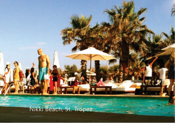
Nikki Beach, St. Tropez