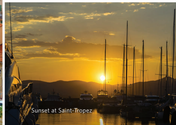
Sunset at Saint-Tropez