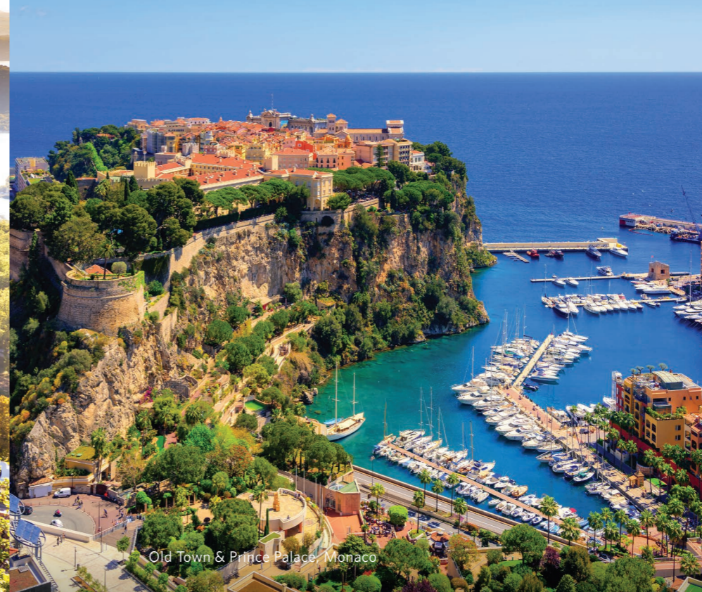
Old Town & Prince Palace, Monaco

Domaine Sainte Marie - Located between Bormes-les-Mimosas and Saint-Tropez, in the Dom forest is this treasure of a winery. They offer tastings, tours and even mountain bike tours with tastings. Not one to miss! 45 minutes' drive from Le Preverger.