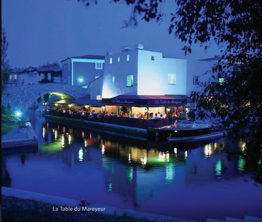
La Table du Mareyeur