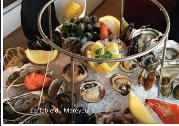
La Table du Mareyeur