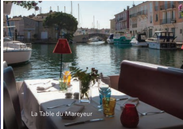
La Table du Mareyeur