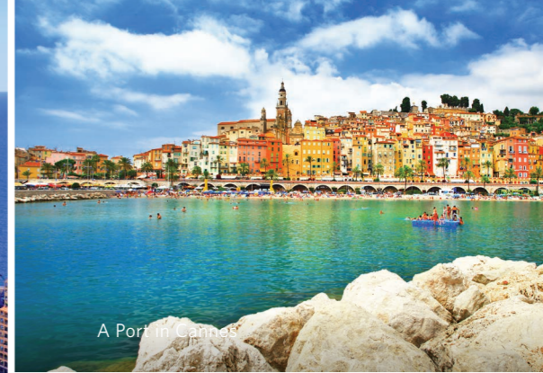
A Port of Cannes

Monaco is the second smallest nation in the world (after Holy See), and the second most densely populated. You'll know you've arrived from the moment you enter the impressive, elegantly appointed destination. Visit the Prince's Palace set high upon the rock of Monaco, and toast to the good life!