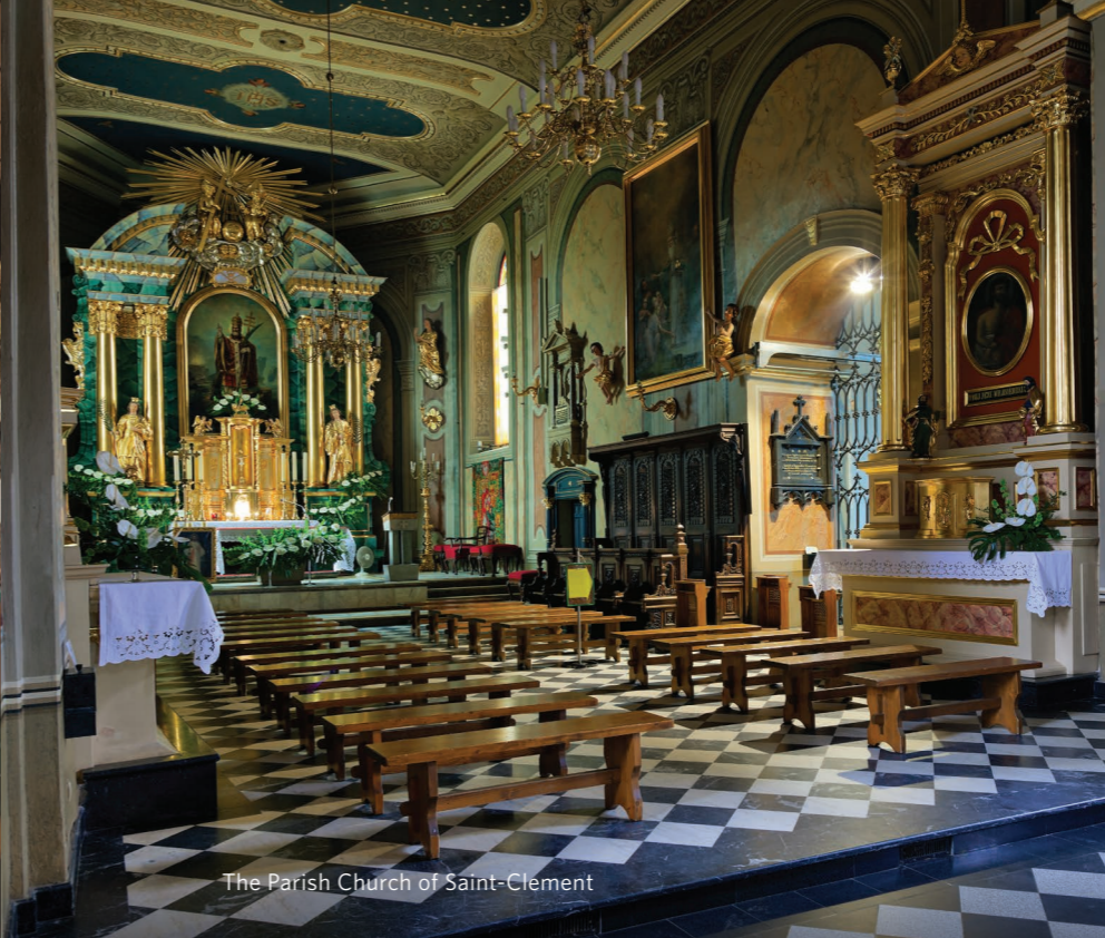
The Parish Church of Saint-Clement