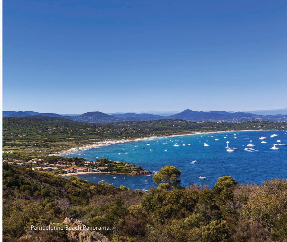
Pampelonne Beach Panorama