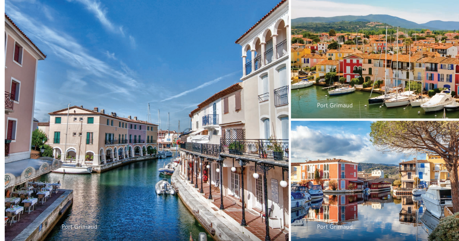
Port Grimaud (50 meters from the resort)