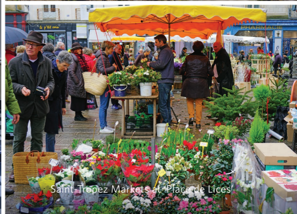
Saint-Tropez Markets at 'Place de Lices'