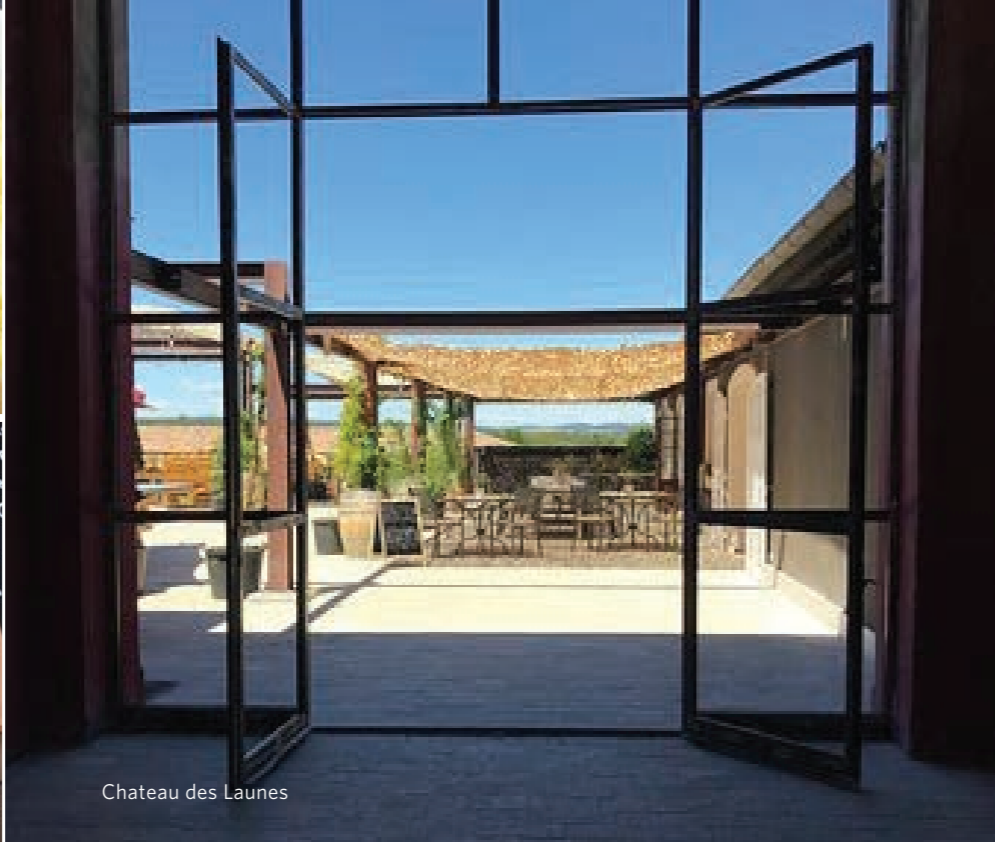
Chateau des Launes