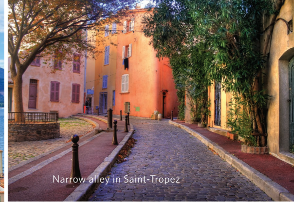
Narrow alley in Saint-Tropez