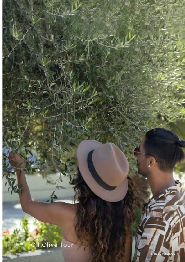
Oil Olive Tour