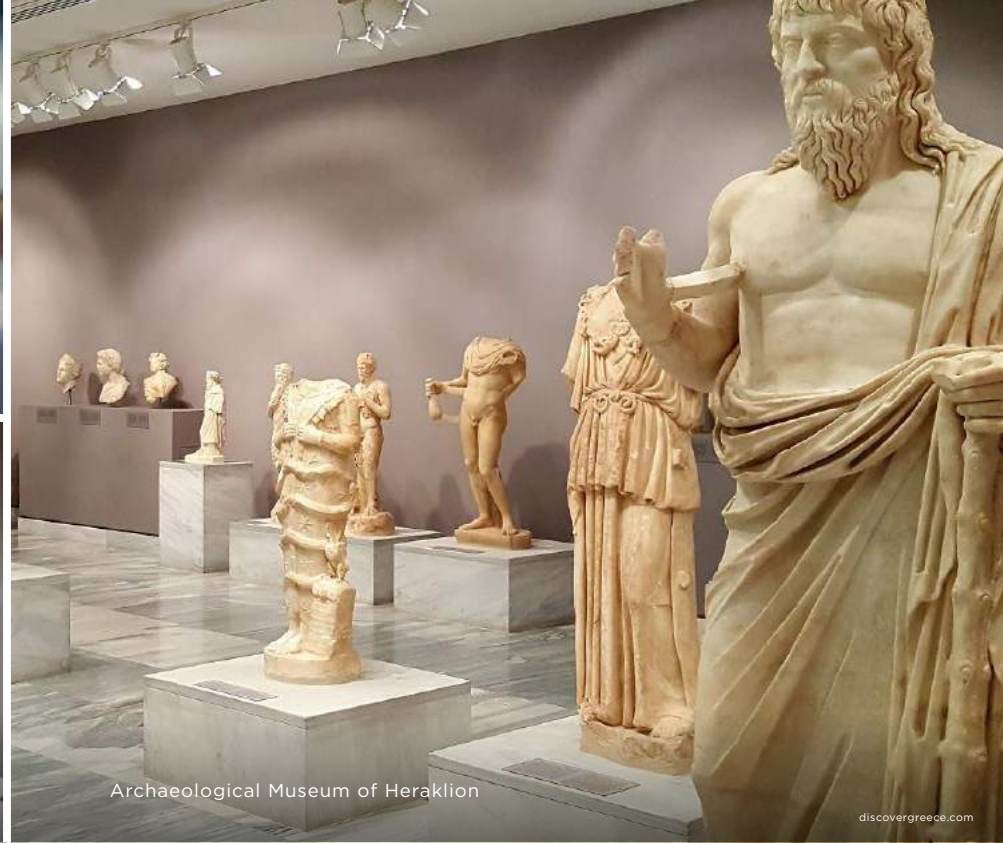
Archaeological Museum of Heraklion