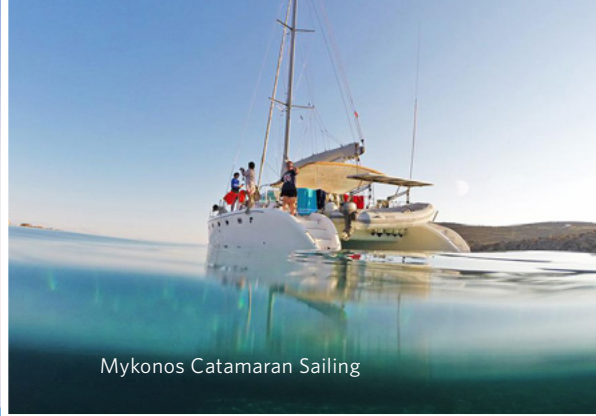
Mykonos Catamaran Sailing