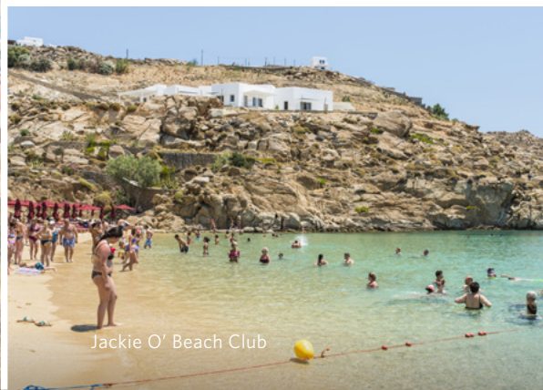
Jackie O' Beach Club