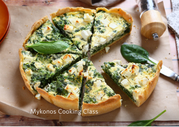
Mykonos Cooking Class