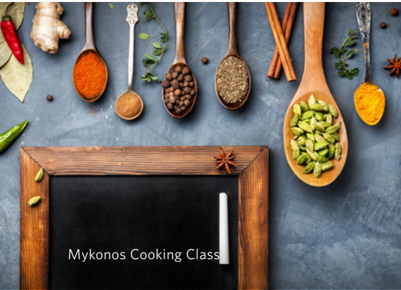
Mykonos Cooking Class