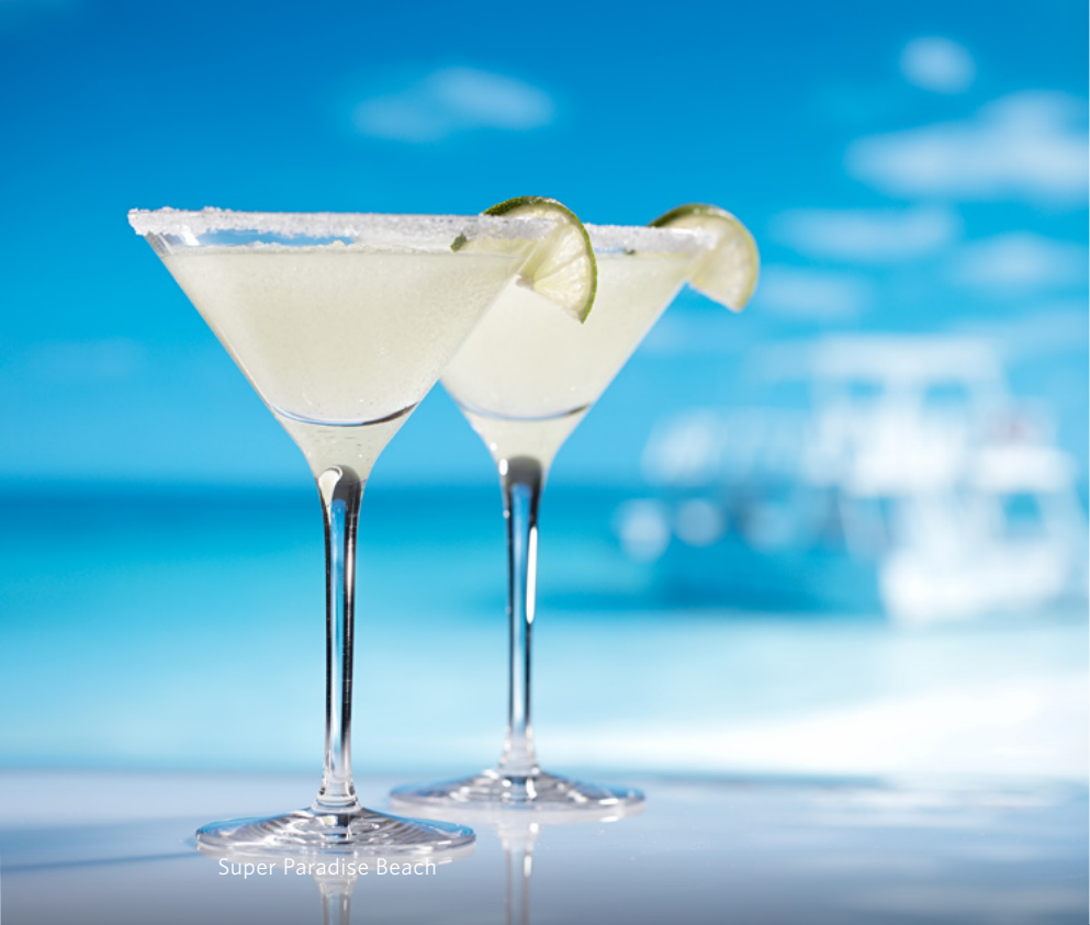
Super Paradise Beach