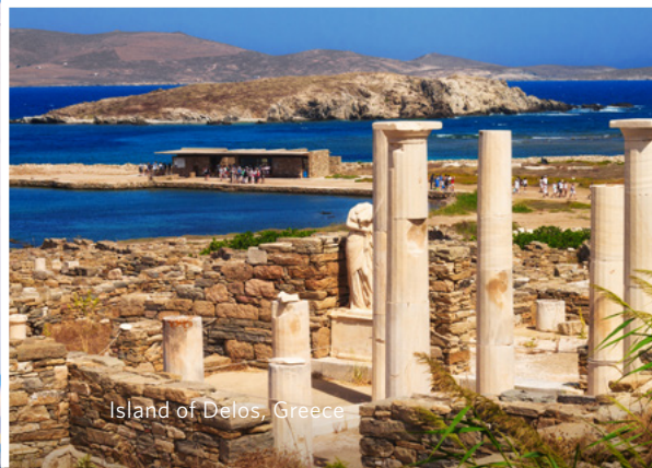
Island of Delos, Greece