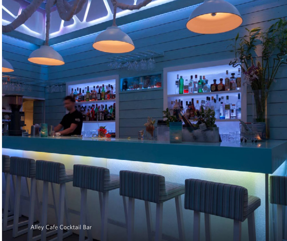
Alley Cafe Cocktail Bar