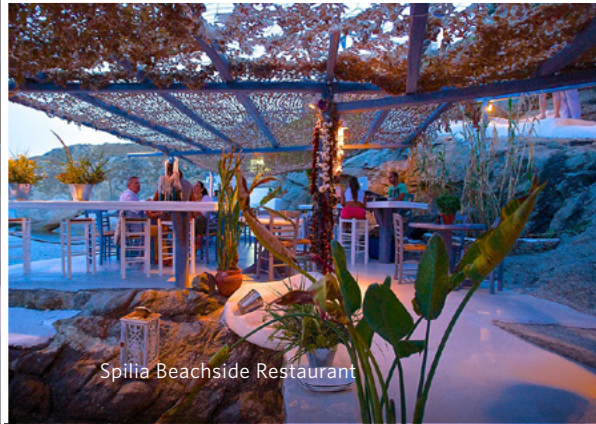
Spilia Beachside Restaurant