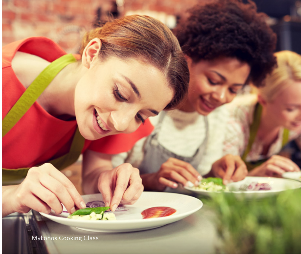
Mykonos Cooking Class