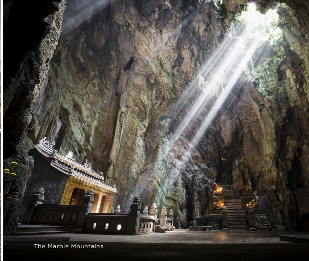
The Marble Mountains