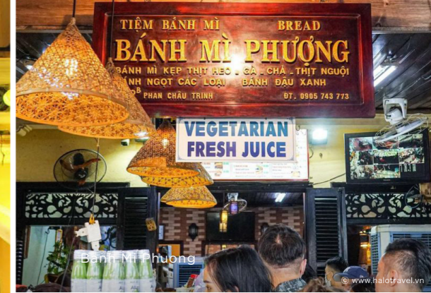
Banh Mi Phuong