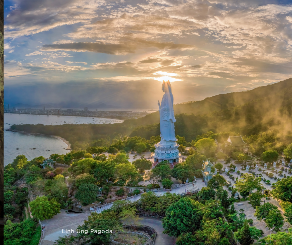
Linh Ung Pagoda