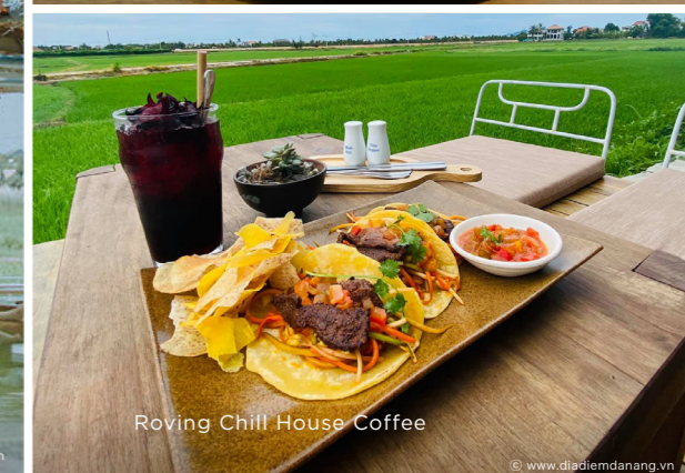
Roving Chill House Coffee