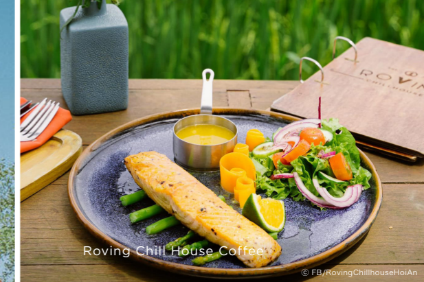
Roving Chill House Coffee