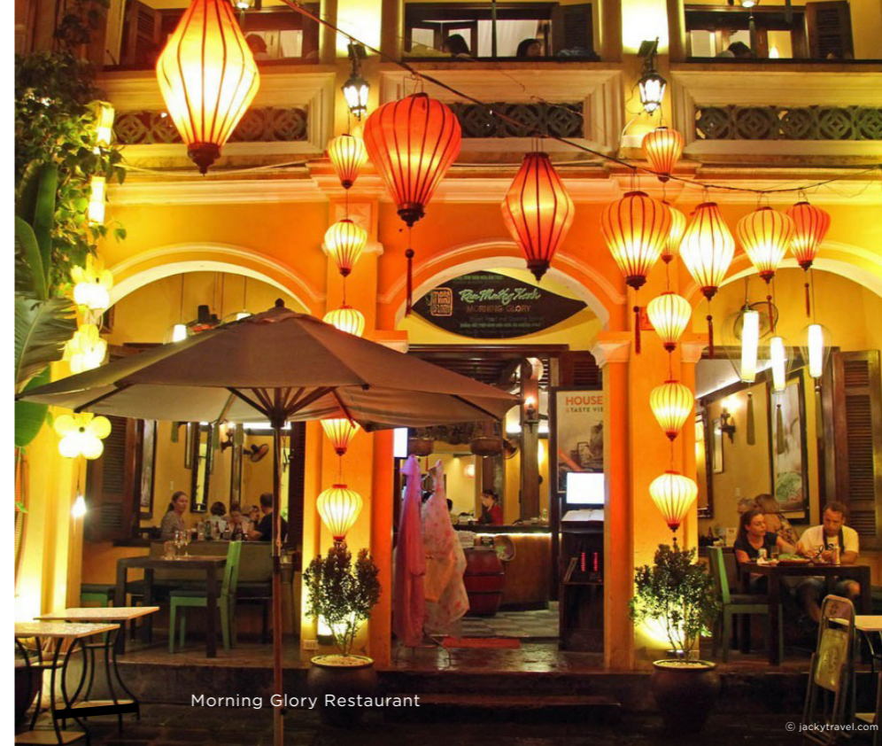
Morning Glory Restaurant