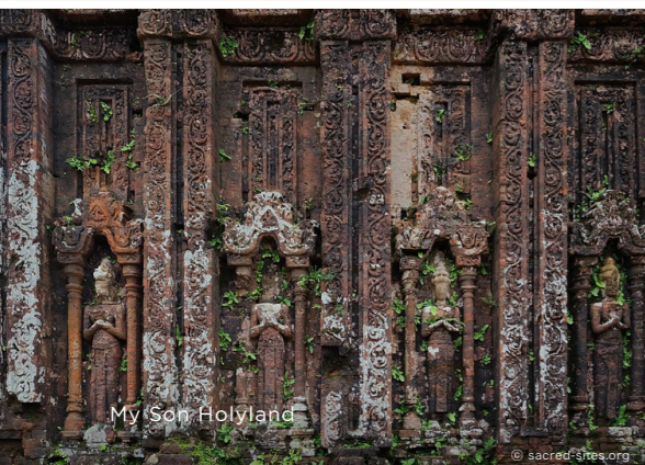
My Son Holyland