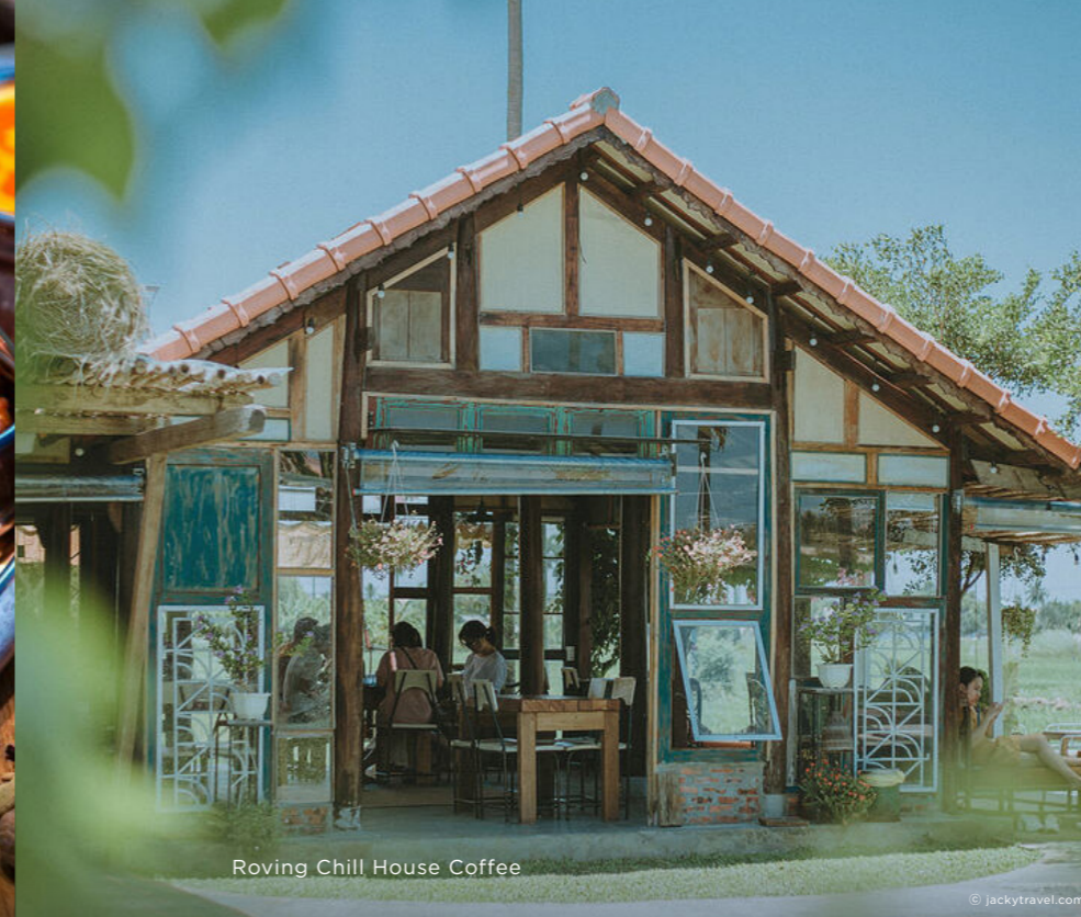
Roving Chill House Coffee