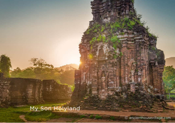
My Son Holyland