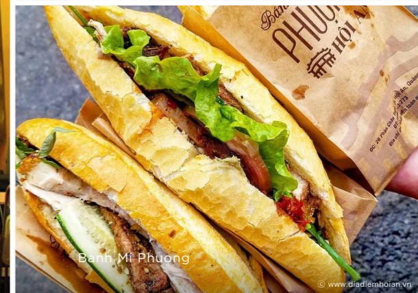
Banh Mi Phuong